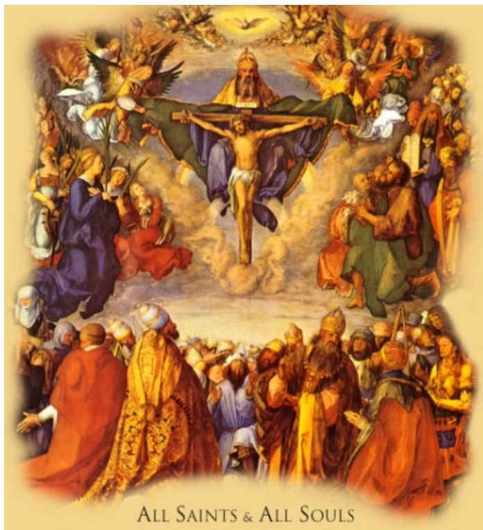
ALL SAINTS & ALL SOULS