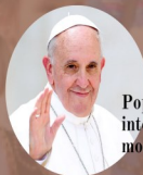
Pope Francis' intention for the month of January

We pray that the Holy Spirit may help us to recognize the gift of different charisms within the Christian community and to discover the richness of different traditions and rituals in the Catholic Church.