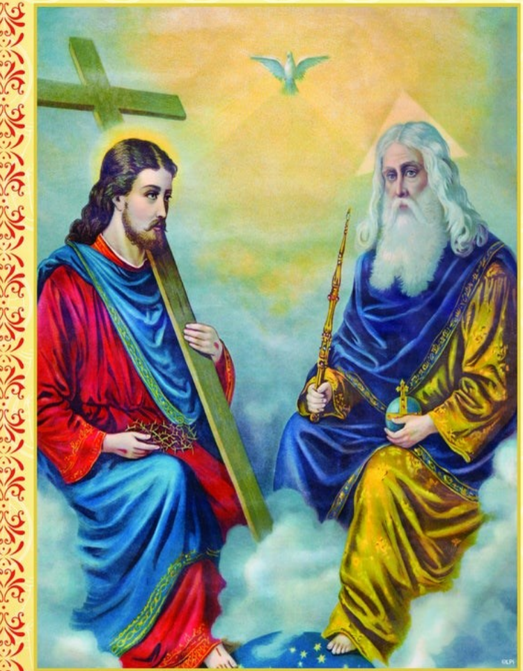
Jesús, mirándolos fijamente, les dijo: "Es imposible para los hombres, mas no para Dios. Para Dios todo es posible". - Mc 10, 27 Excerpts from the Lectionary for Mass 02001, 1998, 1970 CCD. Leccionario II © 1987 Comisión Episcopal de Pastoral Litúrgica de la Conferencia del Episcopado Mexicano.

Jesus looked at them and said, "For human beings it is impossible, but not for God. All things are possible for God." - Mk 10:27